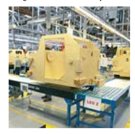
Fig 1 The SWE Workshop

In common with many other sites across the world, IBC, in 2004, installed a Simulated Work Environment, SWE, with which to train staff in the common practices of their automotive production line. These practices are underpinned by the principles of Lean manufacture and in particular continuous improvement.