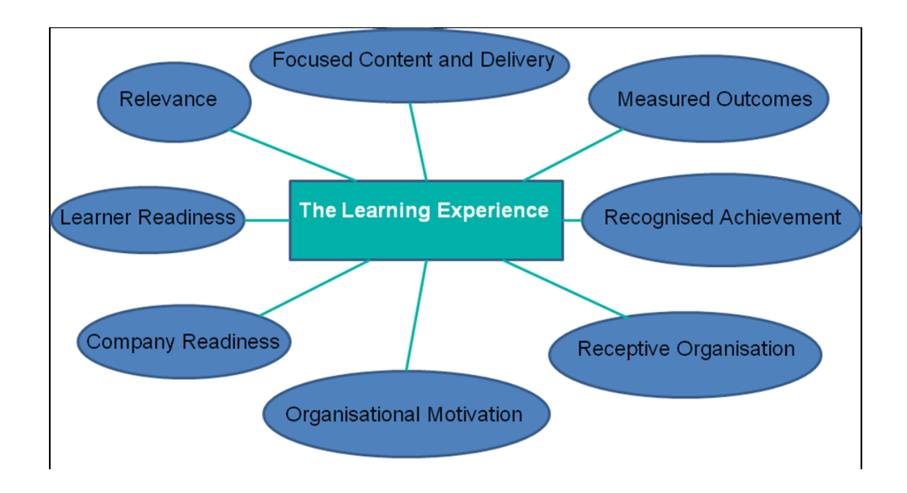
Figure 3 Learning Experience