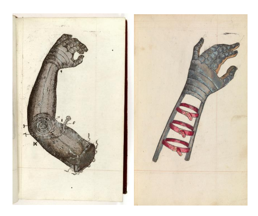
Figure 9: Illustration of a prosthetic hand. Ambroise Pare 1564.

Excluding Paré's text there appears to have been very little written of prosthetic arms in medical text, and many of the advancements that followed the men described in this section, did not occur until the mid-nineteenth century. It is possible that the rareness of missing limbs on adult patients meant that prosthetics were only designed and manufactured when required, and that patients would choose to receive treatment from someone already established as an expert. As warfare evolved over time and more soldiers became affected by missing limbs, it is arguable that the production of prosthetics also developed. The more common an issue, the higher the demand and supply. The variety in other forms of supportive aids such as crutches, and later wheelchairs, meant that the patient's use of a prosthetic may have depended on their circumstance and occupation, meaning whether they needed to be independently mobile or not.