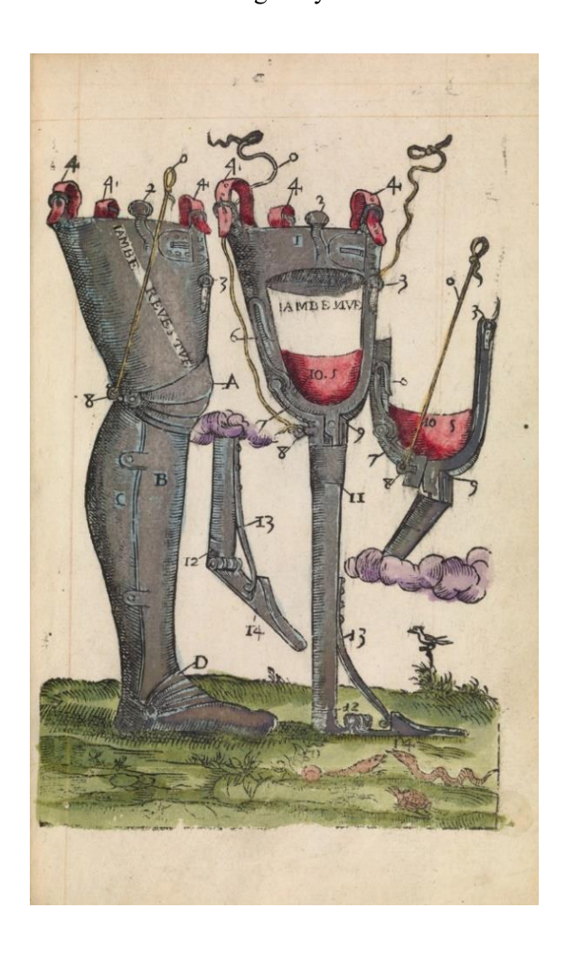
Figure 6: Illustration of prosthetic legs. Ambroise Pare, 1564. Photo Credit © Wellcome Collection

Ambrose Paré has been a consistent feature of this chapter, and his expertise and knowledge did not wane when discussing limbs. Unlike some other authors Paré described different types of aids for the limbs. 131 From the image below it is clear that his depiction of a false leg was not meant to look realistic, but instead serve a purpose, though perhaps under long clothing its visibility was limited. Paré's illustration originally dated from 1564 shows two different types of legs.