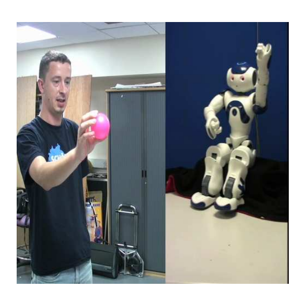
Fig. 1: Experimental setup. The human partner is in front of the robot, moving a pink ball between the four different positions in the visual field. The robot learns the proper response to mirror the actions of the human partner.

In our setup, the robot is trying to learn to mirror the actions of the human partner, following the position of a pink ball in its visual field, as in Fig 1. The robot has to learn the four different sensorimotor associations, corresponding to the four possible positions (left arm up when the ball is in the top right of the visual field, left arm down when the ball is in the bottom right, and respectively for the left side). The learning algorithm itself functions as follows and the main components are depicted in Fig.2.