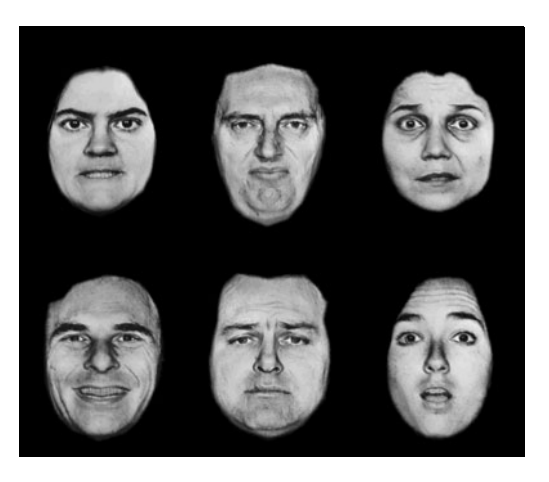
Fig. 1. Examples of the six different expressions at 50% intensity: above (left to right): anger, disgust, fear; below (left to right): happiness, sadness, surprise.

The participants performed a series of computerized tasks designed to test different aspects of face processing. These included two tests of emotional face processing, a test of familiar face recognition and the Benton Facial Recognition Test (BFRT; Benton et al. 1994), a structural encoding task.