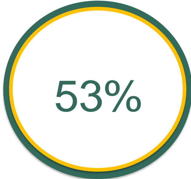
Percentage Breakdown of Student Responses: Research Experience, Health Research Opportunities, and Interest

Have not participated in health research