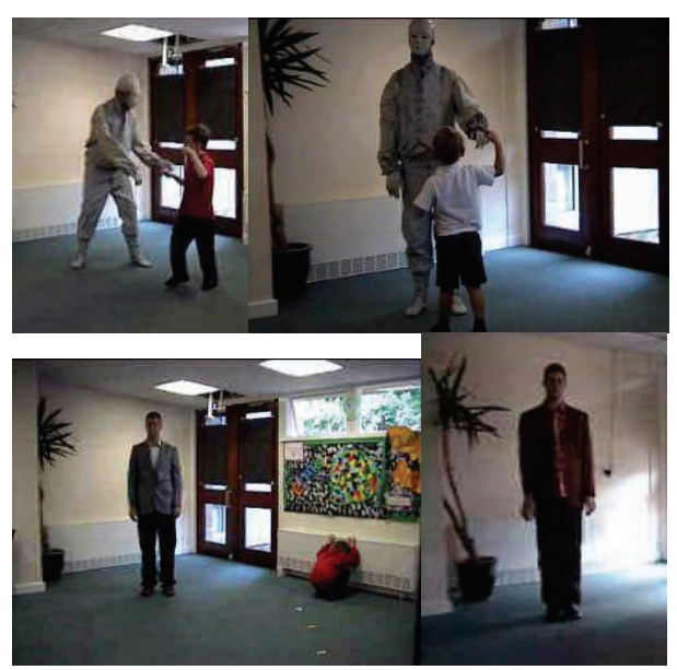
Figure 2: HRI Experimental Paradigms: The Theatrical Robot used to evaluate interactions of children with autism with a humanoid robot of either 'robotic' (reduced features) or 'human-like' (full human features) appearance, while behaving identically (Robins, B. et al. 2006).

Figure 1 shows a sketch of a typical development time line of HRI robots. In an initial phase of planning and specification, mock-up models might be used before hardware and software development commences (Bartneck, C. & Jun, H. 2002). Once a system's main components have been implemented, a WoZ study is applicable, and/or video based methods can be applied (Woods S., et al. 2006). As soon as working prototypes exist that also conform with safety requirements, interaction studies can be conducted. The Theatrical Robot paradigm allows one to conduct interaction studies even from the early phase of planning and specification onwards throughout the whole development of the robot. Once working prototypes exist mock-up models or the Theatrical Robot are likely to become less useful since interaction studies can be run with the 'real system' rather than its embodied simulation. However, the Theatrical Robot can also be used as a stand-alonemethod, without necessarily being linked to a robot development project. For example, the Theatrical Robot paradigm has been used successfully in a study investigating how children with autism respond to a robot with different appearances (Robins, B. et al. 2006).