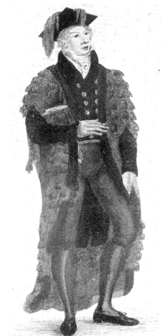
Figure 2: TCD Fellow-Commoner (c. 1820)