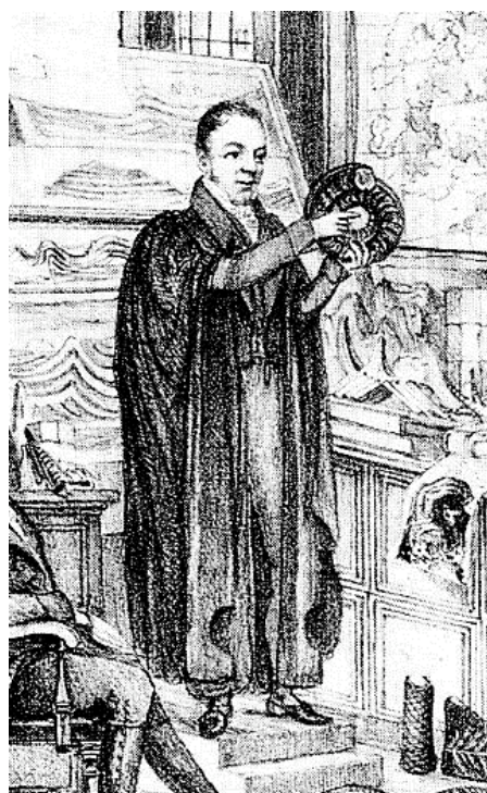
Figure 1: William Buckland in his Oxford MA gown, lecturing on fossils (1823)

Another living Oxford fossil may be the cut-out on the sleeve of the masters’ gown used at Trinity, which even today is identical with the shape shown on the boot of the Oxford MA sleeve by Nathaniel Whittock in his print of Buckland’s 1823 lecture (see Figure 1 below). 11