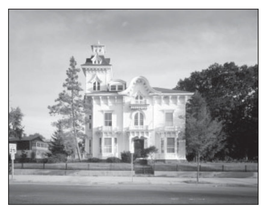
Figure 1. The Prentice Mansion at 514 Broadway, Providence, Rhode Island, the site of the Tirocchi shop and residence from 1915 to 1947; front view, 1999.

standard of interdisciplinary research of interest to scholars of twentieth-century material culture, business history, immigration history, art, costume, and design history, public history and women's studies.