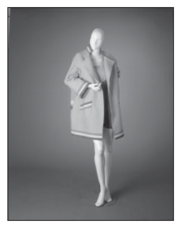
Figure 4. Art Moderne floral beach jacket in wool felt by Tuck-Wite, New York.

satisfactory by the clients for whom the garments were made. Other extant garments represent the less responsible side of consumption and the risk inherent in a custom business. Correspondence revealed that some garments remained at the shop because the client refused to pay for the garment, even if there were no stylistic flaws. The Tirocchis' stock of French accessories, including jewelry, dress ornaments, and handbags also provided more conservative clients with access to the French modernist movements.