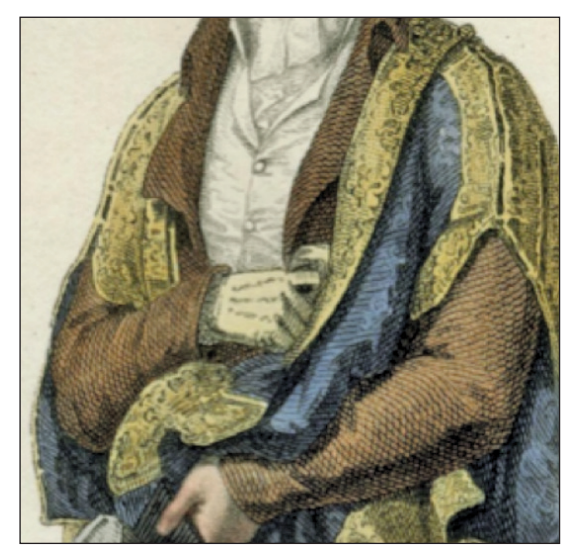
FIG. 8 Nobleman in full dress: detail from Uwins 1813.

Ambient fashion often becomes incorporated into academic dress de facto , and is formally accepted—and regulated—only some time later. But there may be a considerable delay—sometimes many decades—between the emergence of a lay fashion in the outside world, and the appearance of the first university sanction for it;<sup>25</sup> in such cases it is interesting to enquire when the feature was first tacitly adopted and used in academic dress. If our conjecture is correct, this portrait of the Fifth Earl constitutes