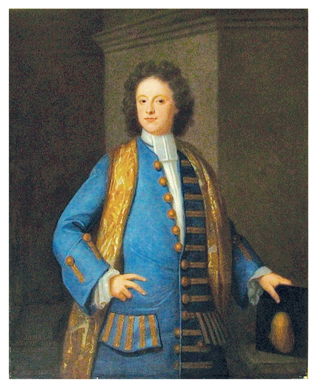
FIG. 1 James Cecil, Fifth Earl of Salisbury, who lived 1691–1728.