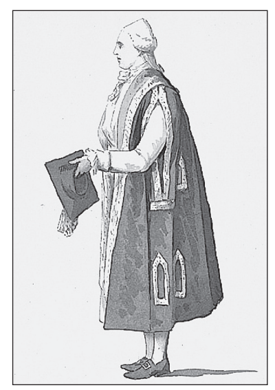
FIG. 7 (Below) Roberts 1792 : Nobleman (left), Baronet (right) in full dress.