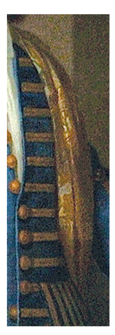
FIG. 4 Details of Fig. 1.