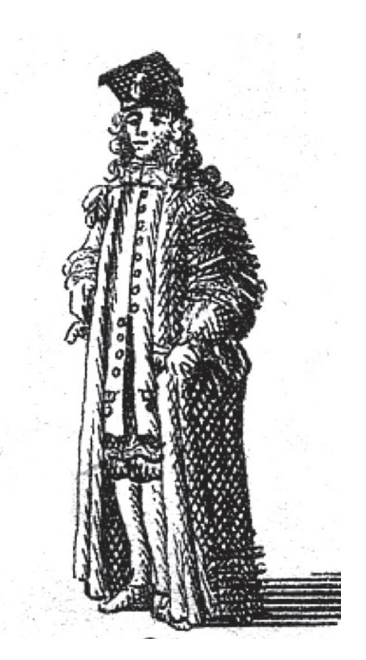
FIG. 3 Nobleman from Loggan 1675 (left), van der Aa 1707 (right).

soever presume to wear a Square Capp, but onely those who are allowed by Statute.'9