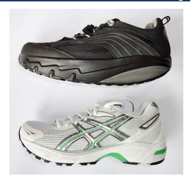
Figure 1 Study shoes: rocker-sole shoe (top); flat-sole shoe (bottom).

Data collection occurred at the 'One Small Step Gait Laboratory', Guys' Hospital, London. Demographic, back-pain disability (Roland-Morris Questionnaire) and pain scores (numerical rating scale) were recorded at baseline.