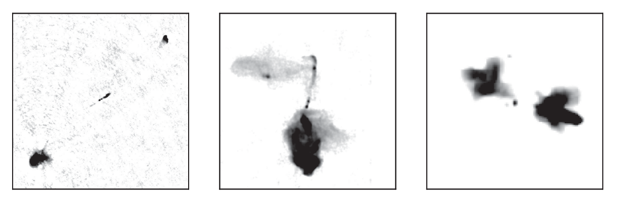
Figure 1. Examples of sources excluded from the sample due to irregular morphology or lack of extended lobe emission at low frequencies, from the left- to right-hand panel: 3C 321, 3C 433 and 4C 73.08.