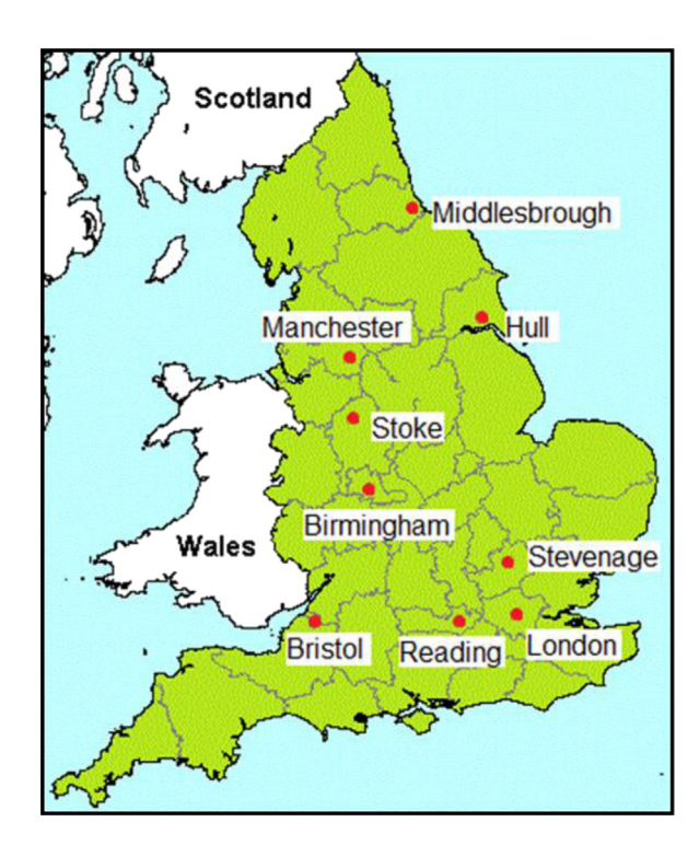
Figure 1. A map of England shows the location of the 9 renal units selected for the study.

Participants were interviewed face to face in their own homes, in the renal unit while receiving dialysis, or by telephone by an experienced qualitative researcher (S.T.-C.) with whom they had had no previous contact. The interviewer presented herself as an impartial nonclinical observer interested in participants' own views. All participants gave written informed consent. Interviews followed a semistructured guide that asked participants about their knowledge and understanding about management options and reasons for their management decision (Item S1, available as online supplementary material). A semistructured format was used to ensure that all participants were asked relevant questions and to allow participants the opportunity to talk about issues that were important to them. <sup>18</sup> Interviews were audiorecorded and transcribed verbatim. Transcripts were checked by the interviewer but not by participants. Recruitment and interviews continued until the interviewer was satisfied that the