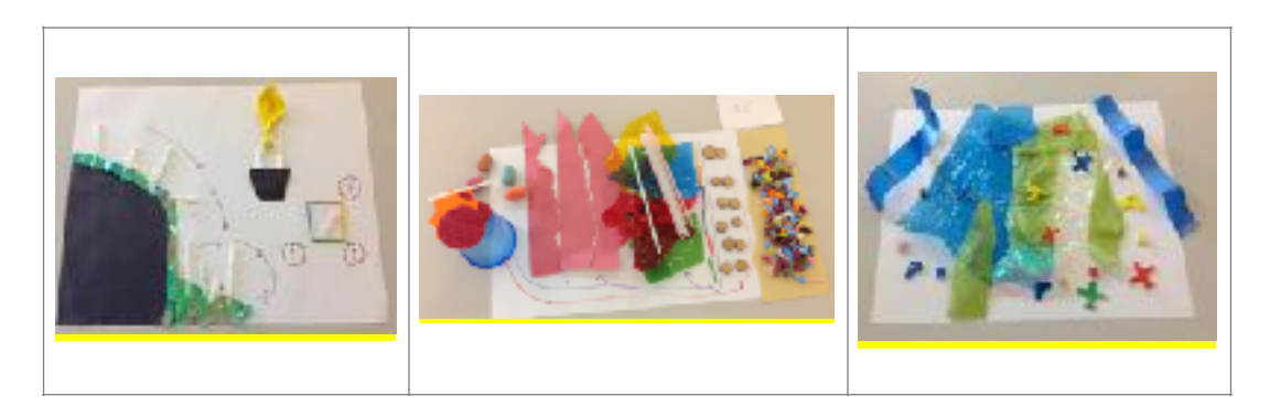
Figure 5: Leadership as a social process (2)