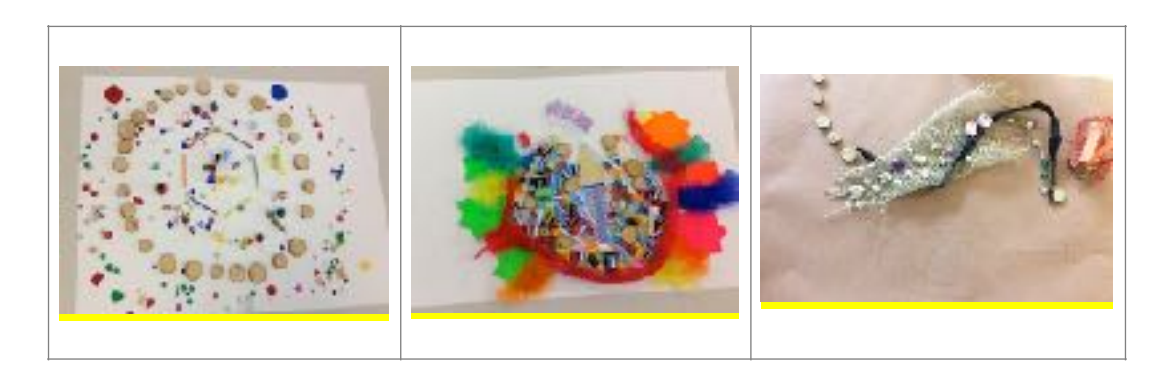
Figure 2: Images of holarchy