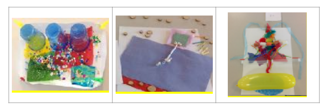
Figure 4: Leadership as a social process (1)