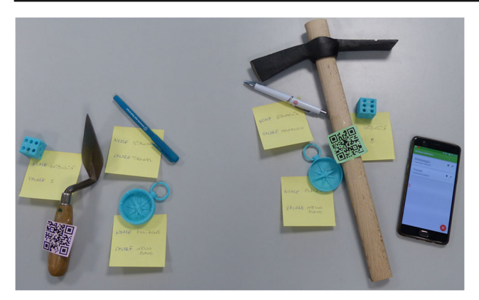
Fig. 2 The Tangible System: tangible attributes, post-it notes, and a smartphone are used to define the CAs

principles and usability criteria. At the end of this phase, three different proposals emerged and gave rise to the three proto-types described in the following sections.