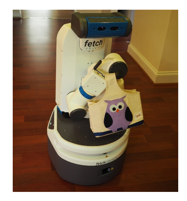
Figure 1: The Fetch robot at Robot House, its arm configuration, and the basket used for the experiment.

Modeling and exhibiting social signals appropriately can aid the robot in communicating its current state [19] and guide users through an interaction situation [23].