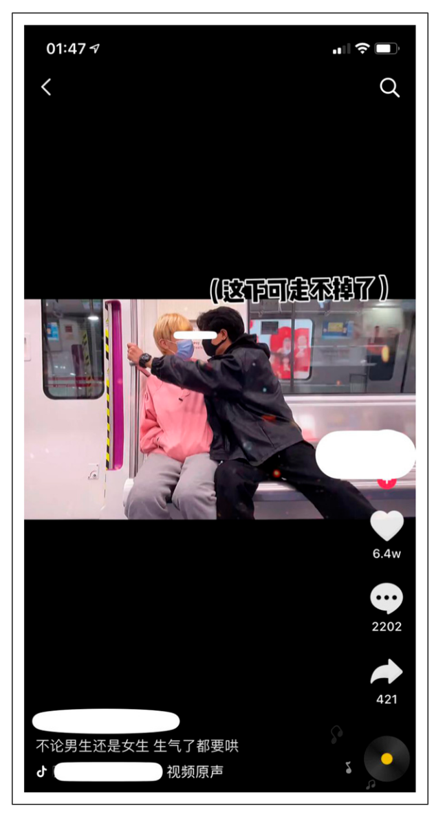
Figure 2. Gay short video creator "S" (22-year-old, with 1,402,000 followers) "kabedoning" his boyfriend in public transport on Douyin.

Douyin seems to make Chinese gay men feel positive, promising them new queer(ed) spaces with visibility, possibility, and pleasure, and providing a basis for contact, communality, and community. Its algorithm shifts the dialectics of public and private arenas, allowing for a wide range of social (and erotic) contact, and sometimes, it can even